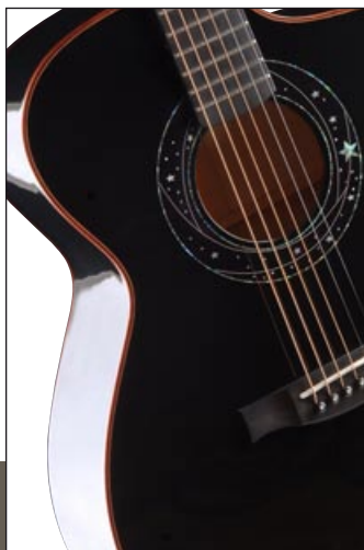
Left: Abalone, MOP, and ebony are used for the rosette. Right: The Starwalker »Galaxy« has a black high-gloss finish with padouk binding.